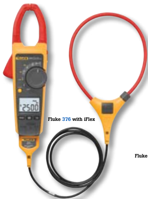
Fluke 376 with iFlex